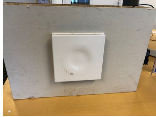
fig 6 - flat grill fitted on dormant side