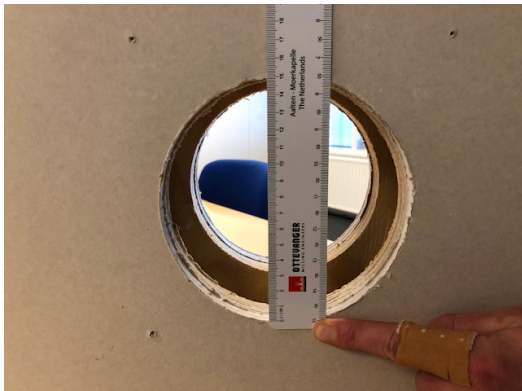
fig 1- Core hole trough the wall (130 to 150 mm)

Minimum wall thickness is 12cm and there is no specific maximum wall thickness as the fan cartridge and dormant cartridge can be separated to suit the thicker wall.