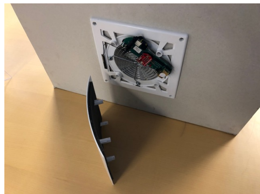
Fig 4 - Fan cartridge (from fresh air side)