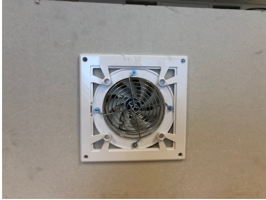
fig 5 – installed dormant cartridge